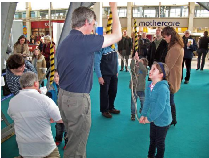
Another young person has a go

The practical aim of the course was to just teach the students to ring a bell on their own. Most achieved this stage, some with a little assistance. In the last module we introduced the students to rounds and the concept of ringing as part of a team. We also demonstrated change ringing as something for them to aspire to.