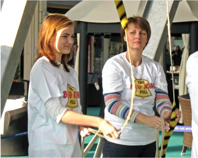
Teachers and helpers wore matching T shirts

At the end of the day, 41 people had willingly signed onto the intensive 2-week training program and 2 lapsed ringers were brought out of hibernation.