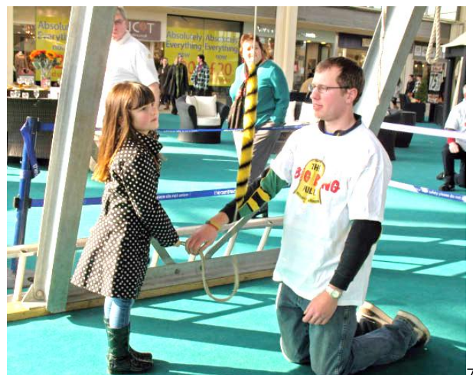
A young person has a go

At 10 am on Saturday 25th February Downs Barn opened its doors to a professional approach to recruitment and engagement. Tea and coffee was available to all comers; a dedicated presentation suite was set up in the hall, supported by display stands, rolling video and training booking desk. Ringing was demonstrated at an individual, rounds and method ringing level, and then the potential trainees were handed over to trainers who helped them with at least backstrokes - some managed more even in a short time.